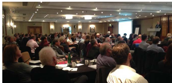
Exchange Forum 6, November 2015, London, UK

It will be an opportunity to update IGD-TP's EF participants on the platform activities during 2016, debrief the community on the recently completed BELBaR, LUCOEX and DOPAS projects and collectively explore the potential of future Joint Activities (through four subject specific working groups).