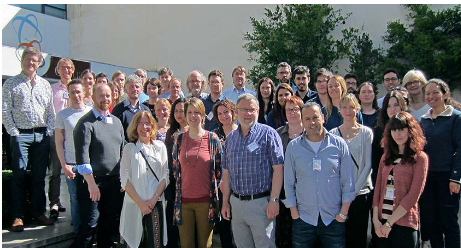
The University of Granada hosted the meeting.

The MIND project had its first Project Annual Meeting on May 2-4 in Granada, Spain. There were 44 participants representing 17 organizations from academic institutions, research institutes, consulting companies, performance assessment, social science and end-users. The end-users that have showed interest to be involved in the review process of the MIND project are SKB, Posiva, TVO, ANDRA, NWMO, Nagra, RWM and ONDRAF/NIRAS. In addition, IRSN is following the project as an observer.