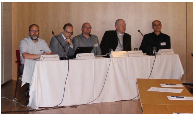
DOPAS Experiment leaders presented the DOPAS Experiments at the beginning of DOPAS 2016 seminar

All seminar materials will be available at http://www.posiva.fi/en/dopas/dopas_2016_seminar