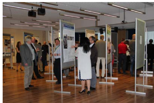
Poster session increased the networking possibilities for DOPAS 2016 participants.