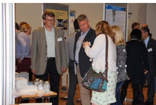
Material samples from Full-scale Experiments conducted within DOPAS Project were informative